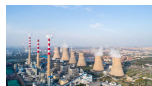
Thermal power generation