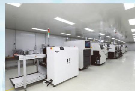
Rotary multi-head high-speed high-precision full automatic SMT machine