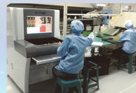
Multi-temperature zone hot reflow soldering and AOI automated optical inspection system