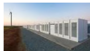
Power distribution peak and frequency regulation