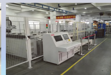
Online lithium cell multi-grade sorting test system