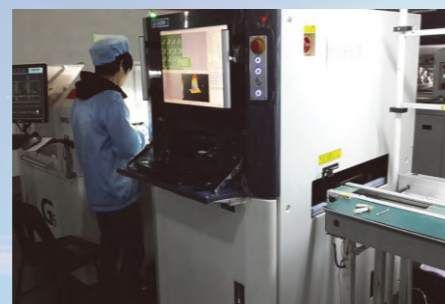
Online 3D SPI solder paste detection system