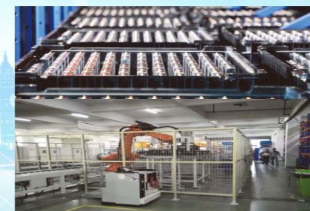
Robot optical positioning laser welding battery core&BMS system