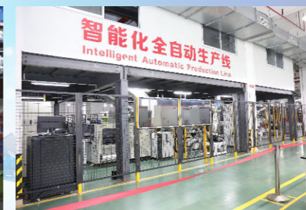
Intelligent automatic production line