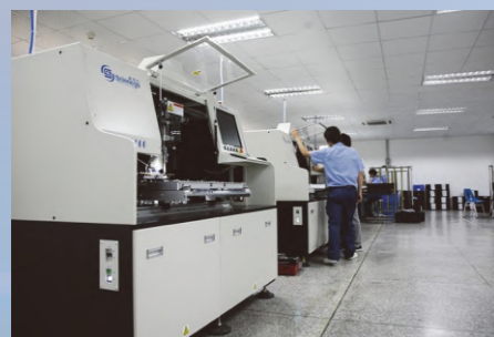
Full-automatic solder paste printing machine