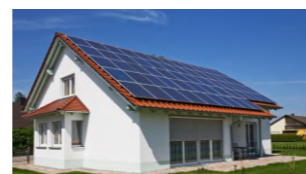
Distributed power generation