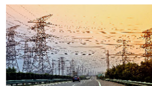
Power transformation side