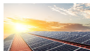
Solar power generation