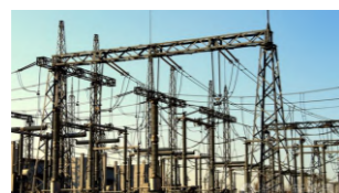
Power transmission side

Power transmission, power transformation, power distribution peak and frequency regulation