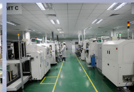
International most advanced SMT production line