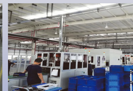
Fully automatic cell stack assembly and optical positioning welding system