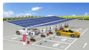
Solar-energy storage-charge station

Distributed energy storage and micro-grid Solar-energy storage-charge battery swapping station