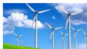
Wind power generation

Renewable energy power plant Thermal power frequency regulation ancillary service