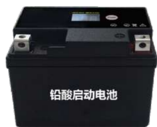
Lead-acid Start Battery