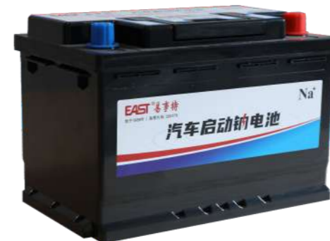
Automotive Start Sodium-ion Battery