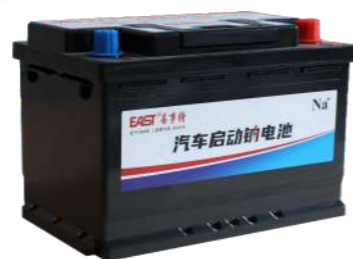
Automotive Start Sodium-ion Battery