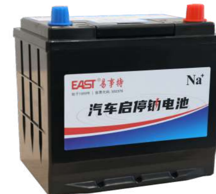
Automotive Start-Stop Sodium-ion Battery