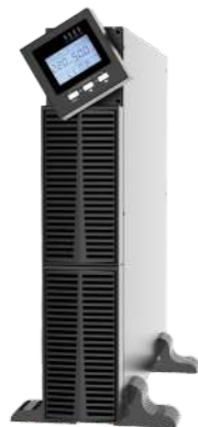
Display panel can be rotated