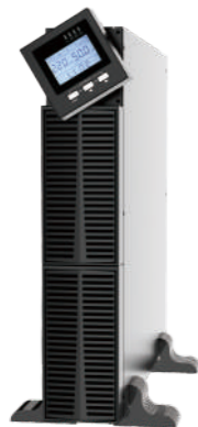
Display panel can be rotated